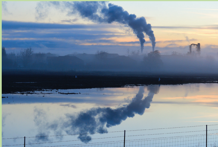
Photo of West Eugene factory.