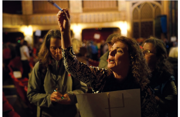
Organizing support for rallies and testimony in favor of Clean Energy and Jobs legislation. In 2020, Gov. Brown stepped in with an Executive Order to mandate what groups like Beyond Toxics have been working toward for years.