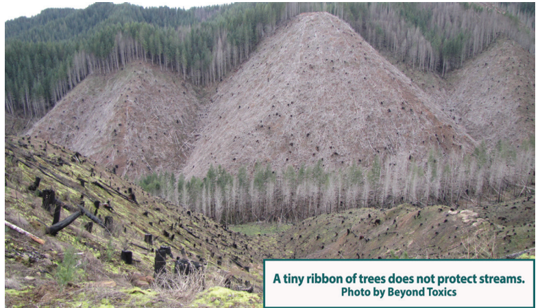
A tiny ribbon of trees does not protect streams.

trees within the 20' no-cut buffer. That's why we see large clearcuts shave the mountainsides clean with just a tiny ribbon of trees along the streams.