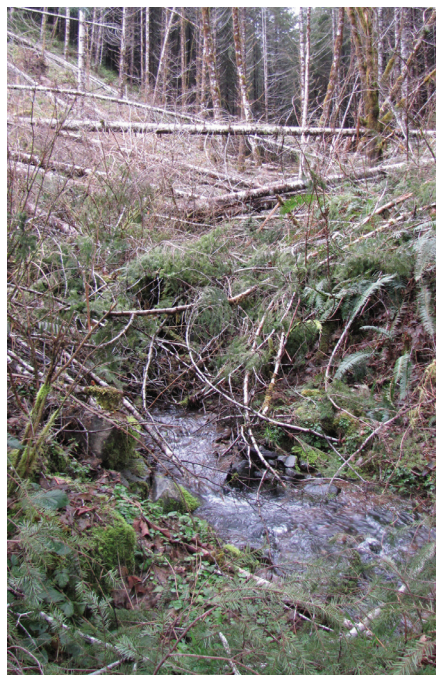
Do you see any buffer protections? Douglas County stream bed, Feb. 2016

Next year Oregon could adopt new stream buffers, but the draft stream buffers are still too small. Why? Oregon's powerful timber industry pours a lot of money and influence into resisting reforms on pesticides and stream buffers.