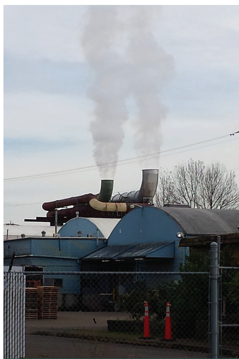
Hollingsworth & Vose fiberglass factory. Ancient smokestacks do little to control air toxics emissions.

An older industrial facility making fiber glass, Hollingsworth & Vose (H&V), has released poisonous gases and heavy metals into nearby neighborhoods for decades.