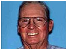
Sheriff's office: Wanted child molester could be trucking cattle in...

( http://www.kval.com/news/local/Downed-tree-causes-crashes-on-Hwy-22-2-hurt-245824681.html )