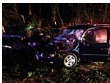
Downed trees cause crashes on Hwy 22

( http://www.kval.com/news/local/Downed-tree-causes-crashes-on-Hwy-22-2-hurt-245824681.html )