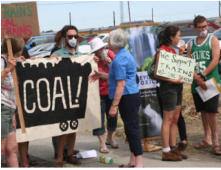
This information was provided by a press release from the City of Eugene.

Comments? Leave comments at the bottom of the page. Lane Today also accepts letters to the editor for publication in our Sound Off section. Please send them to soundoff@lanetoday.com for consideration.