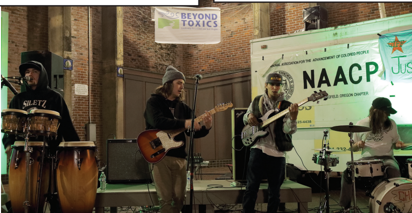
Northwest Reggae-Hip Hop band Chiefed of the Siletz Tribe rocked Kesey Square in downtown Eugene and kept the enthusiastic crowd (right) dancing.