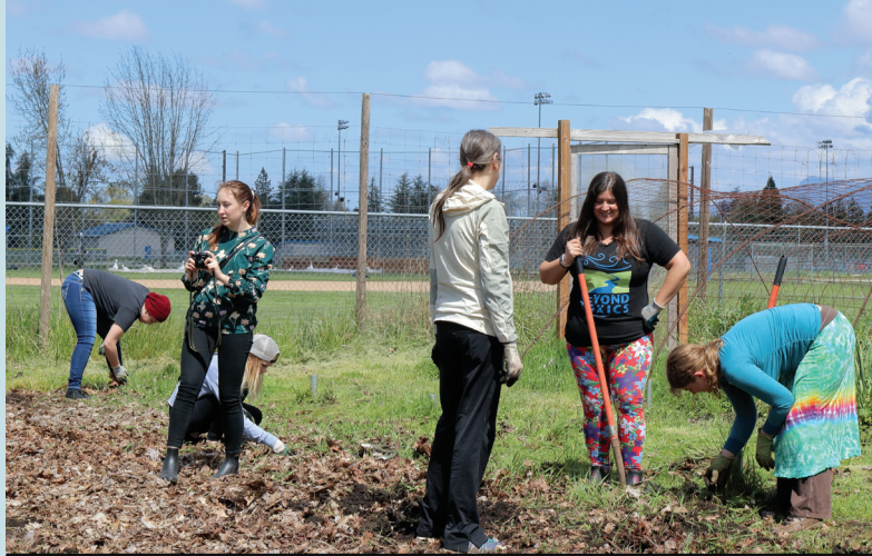
Beyond Toxics organized an Earth Day work party at Churchill Garden in West Eugene.

Native pollinators play a key role in sustaining the framework of food sovereignty, human health and nutrition right here in Oregon. Several studies have shown that wild pollinators are often more efficient than honeybees at pollinating plants. They also visit more plants on average and are stronger pollinators. Though the dramatic loss of honeybees has grabbed headlines in recent years, declines in native pollinator populations may be a more alarming threat to crop yields everywhere.