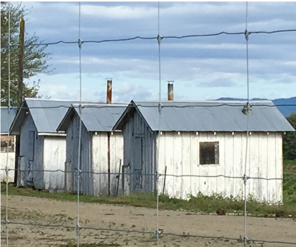
Farmworker housing, Jackson County, Oregon (May 2017)

"Shelter in place" is a euphemism for having farm workers cower inside their wooden shacks while aerial and air blast pesticide sprays swirl all around them. OSHA's misguided "shelter in place" recommendation takes away the 100-ft. no-spray buffer.