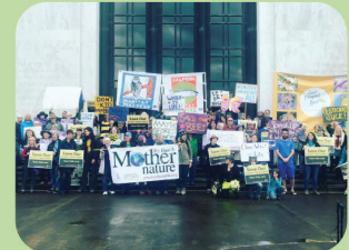
People from every corner of the state gathered to demand stronger environmental leadership in Oregon.