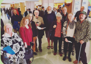
Residents of Cedar Valley harmed by aerial spray return to legislature to testify in support of SB 892, Aerial Spray Notification.