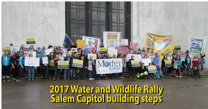
Beyond Toxics and allies rally for Water and Wildlife at the State Capitol April 19th.

Truthfully, seeing our Pollinator Protection Act falter because of one vote was discouraging. Looking forward, I intend to make sure that future Oregonians will never have to ask, "Where was Oregon when our native bees faced extinction and our food security was threatened?"