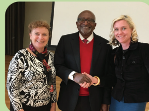
At the CAER conference, we met with Dr. Robert D. Bullard, the father of Environmental Justice.