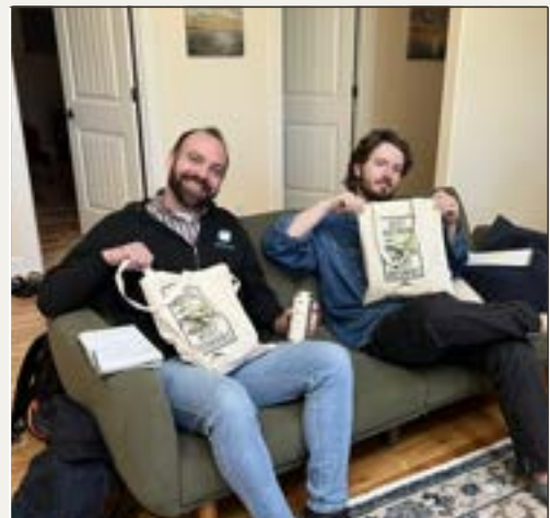
BT staff at our annual staff retreat to kick off the summer