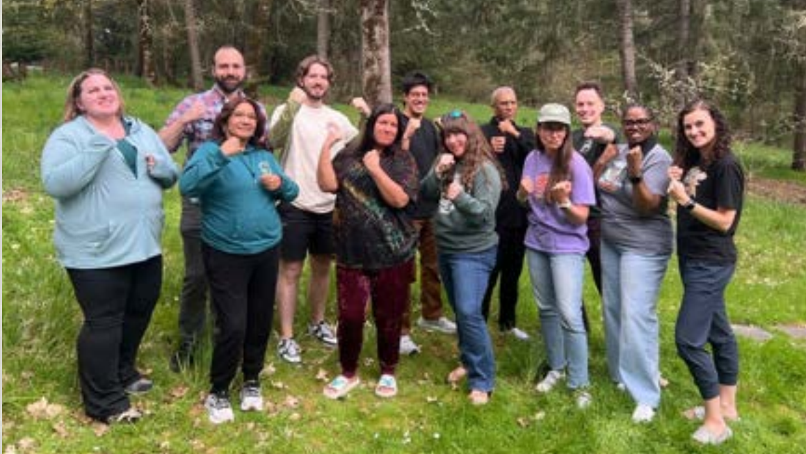
The Beyond Toxics staff, ready to combat environmental injustice, at our 2026 staff retreat.

This past April, the Beyond Toxics team participated in a two-day staff retreat focused on strategic planning goals for 2027 through 2030. Over the course of the retreat, we explored our organizational goals and values and performed an internal analysis of our Strengths, Weaknesses, Opportunities and Threats (SWOT).