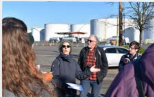
Tour of fuel storage infrastructure in West Eugene earlier this year