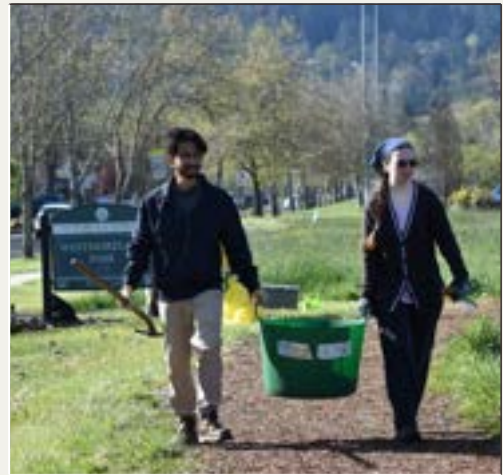
Work party to remove invasive plants at Eugene's Westmoreland Park