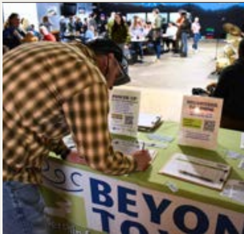
Signing the ECEF petition at our April Launch Party