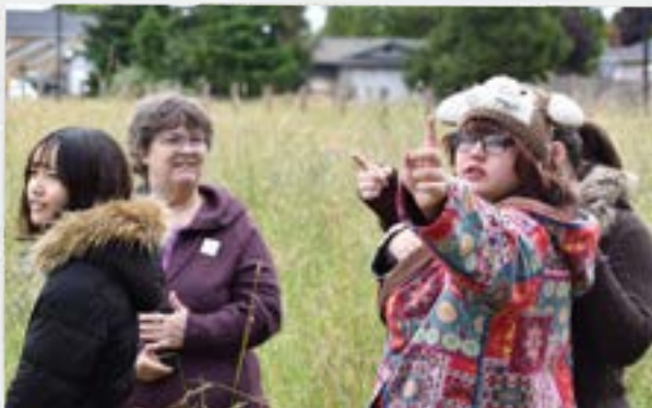
Rise as Leaders Youth Leadership cohort at Golden Gardens